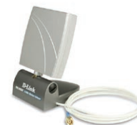
DWL-M60AT Directional Indoor Antenna